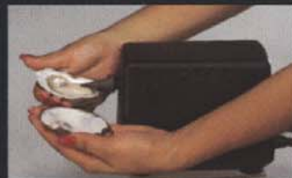
3. CLEAR MUSCLE • REMOVE TOP SHELL