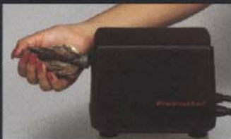
2. DEPRESS FOOT SWITCH