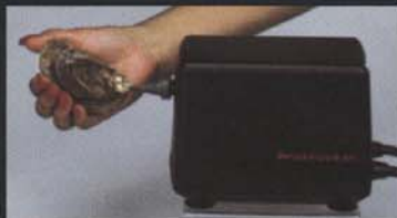
1. HOLD OYSTER HINGE UP TO BIT